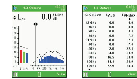
Figure 12. 1/3 Octave graph and list views

When the measurement run has finished, press the Run/Stop key (D). A screen is displayed asking you to confirm the action - press Yes to end the run.