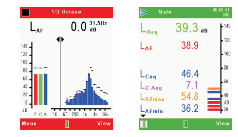
Figure 10, Example Stop and Run screens

Press the Run/Stop key ( D ) to start making measurements. The screen shows green bars at the top and bottom.