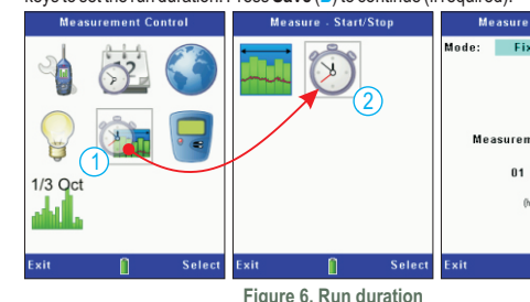
Measurement data sets (Refer to Figure 7)

Select Settings and use the navigation keys to select the Measurement control symbol 1. Press B to continue. Use the navigation keys to select the Measure -Start/Stop symbol 2, Press Edit (B), Use the navigation keys to select the Mode (Key Press / Fixed Duration / Timers). Press Save (B). Use the navigation keys to select additional Fixed duration or Timers options. Press Edit (B), and use the navigation keys to set the run duration. Press Save (B) to continue (if required).