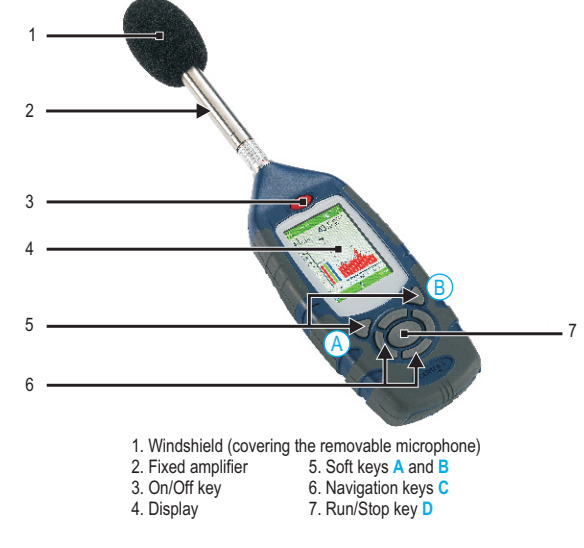
Figure 1. The CEL-63x series